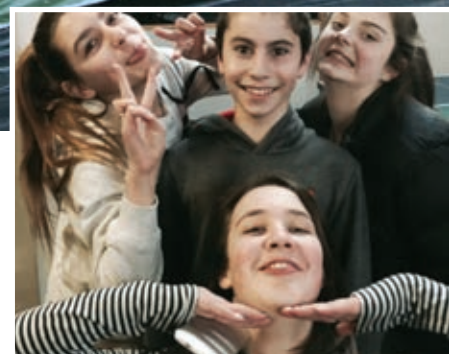
➤ Hanging out with friends at club in Hobart, Tasmania.