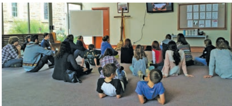
Wyld Life in session – story time.