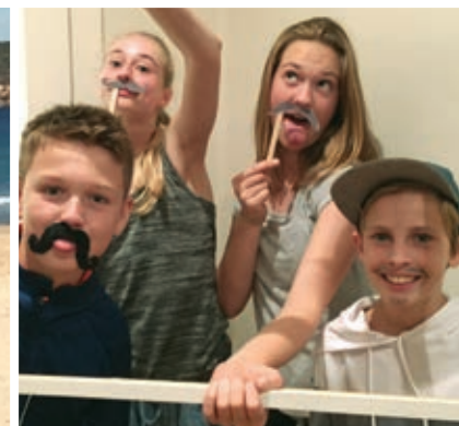
▲ Moustache night at Wyld Life in Ryde.