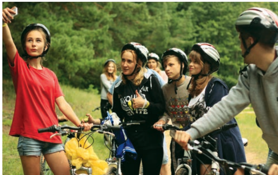
▲ Contact Work in Belarus – sharing a bike journey.

A prayer need for coming year: we are in short supply of full-time staff to train and care for our volunteer leaders.