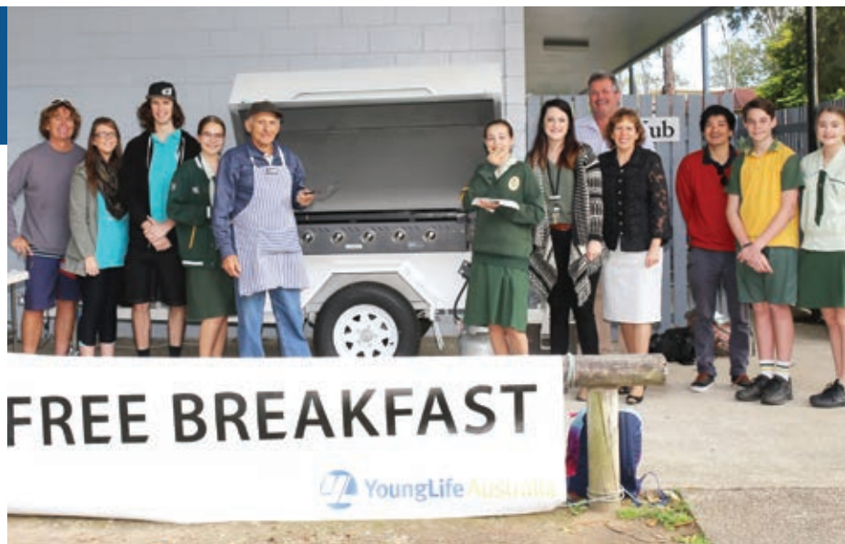
▲ Redlands volunteers with their new BBQ trailer.

Looking forward, Summer Camp will be important for us as a way of introducing friends and the young people we meet to Young Life. We continue to be grateful for the opportunity to work in the local school in support of the students. Our greatest need is for more volunteers.