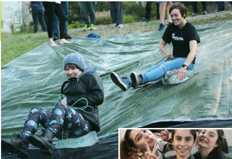
▲ Hobart club is gathering momentum with new volunteers and young people from Clarence High School attending.