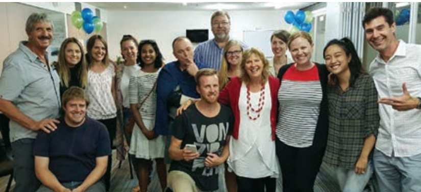
▲ The teams from Maroondah, Monash, Casey and the Mornington Peninsula at a combined gathering in April 2016.