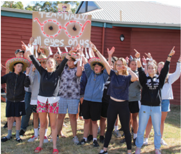
Team spirit was inspired by the Where's Wally theme.

To donate visit www.younglife.org.au/donate