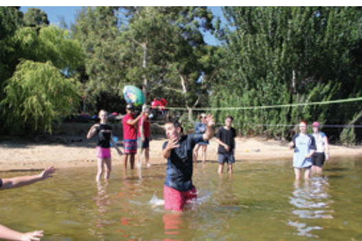
Games on Lake Jindabyne.

"I found camp to be so much fun – a really good week. I hadn't met my girls before, so this was really important. It gave us lots of opportunities to laugh and bond and get to know each other."