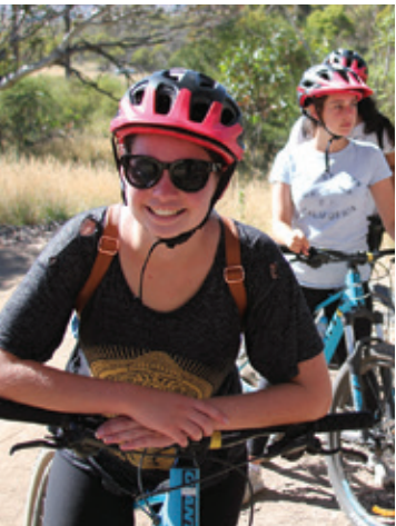
Hitting the bike trail was among the many activities on camp.