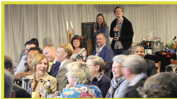
Image, above: Smiles aplenty as the crowd enjoyed the night's festivities