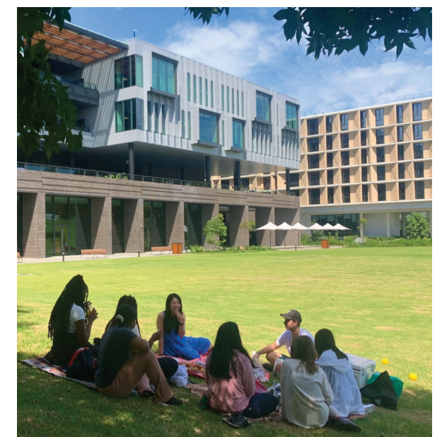
“He loves them and wants to see them come to Him”

“He loves them and wants to see them come to Him. They might be lost or alone but He wants to be their comfort and their strength.”