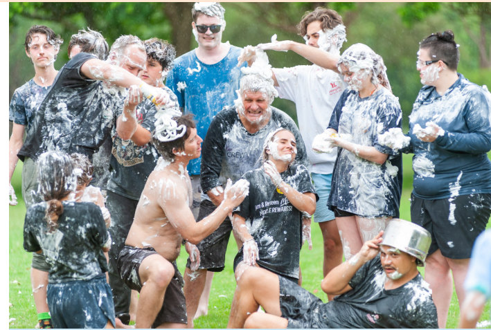
Summer camp at Wiseman’s ferry, NSW